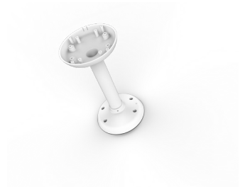
PM-572PD Pendant Mount