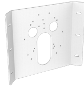
A02 Internal corner bracket