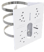
A01 Pole mount