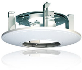
FCM-ND242 False Ceiling mount