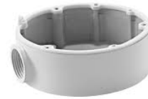
JB-ND242 Junction Box