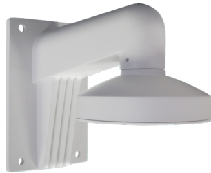
WM-ND242 Wall mount