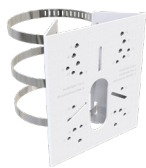
PM-V44FB Pole Mount