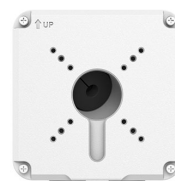
JB-V44FB Junction Box