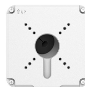
JB-V52VD Junction Box