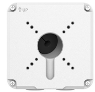
JB-V83ZD Junction Box